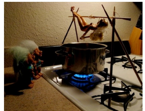
Figure 1: Just because

It's ok if a chief isn't taking classes in the spring of 2012, or even in Hanover for the whole term. The chief only needs to be able to get to Hanover on a regular basis, as there's a lot of Trips work that needs to happen in the spring in Hanover, from croo selection to retreats to capture the wild moose that's been buttered from antler to hoof to regular games of twister and cuddle puddles... you know, the important stuff.